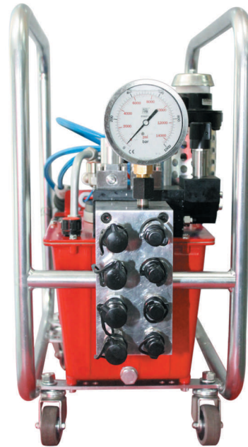
AP1000 with Quadra Port (4 Port)