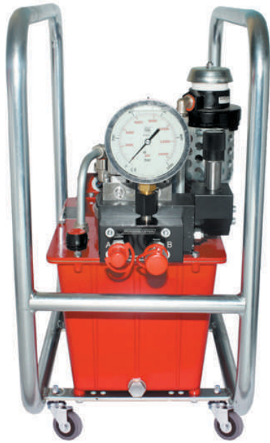
AP1000 with Mono Port