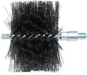
CARBON STEEL BRUSH

Note : Brushes over 1" O.D. require # TCB-C coupling to connect to PFS-750, PFS-875 and PFS-875-SS