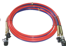
▲ Hoses Hoses available in all lengths (15' hose standard with all pumps)