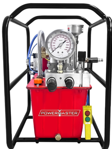
AP1000 with Mono Port