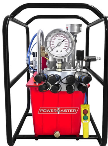
AP1000 with Quadra Port (4 Port)