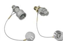
▲ 1/4\" NPT SCREW COUPLER (Standard on all Powermaster equipment)