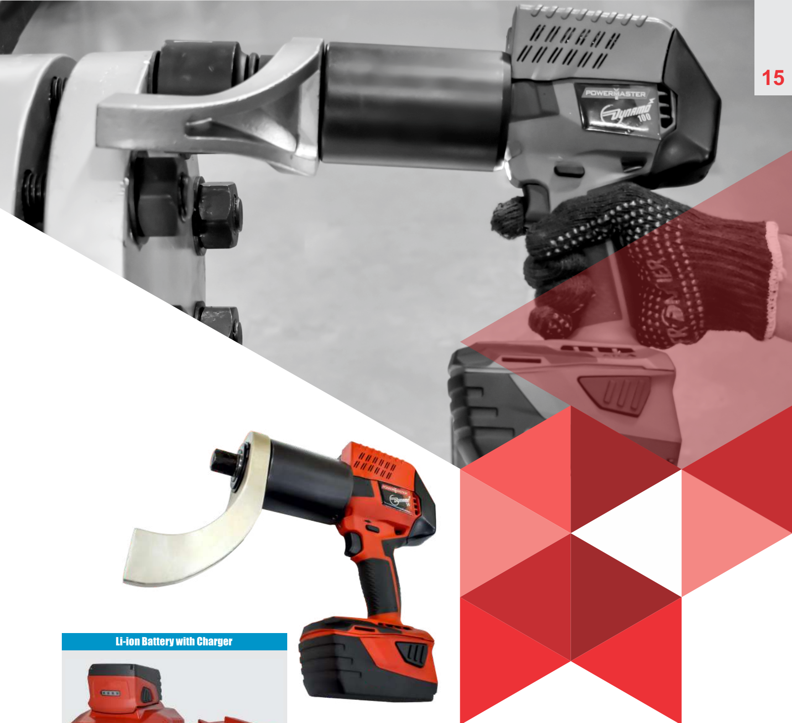
Li-ion Battery with Charger