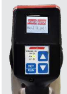
Digital Control Unit