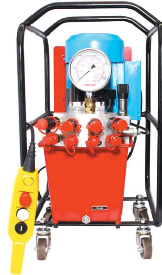
EP1000 with Quadra Port (4 Port)