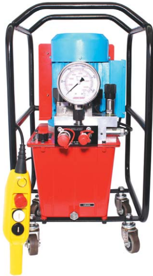
EP1000 with Mono Port