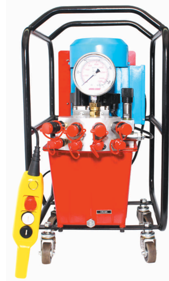
EP1000 with Quadra Port (4 Port)