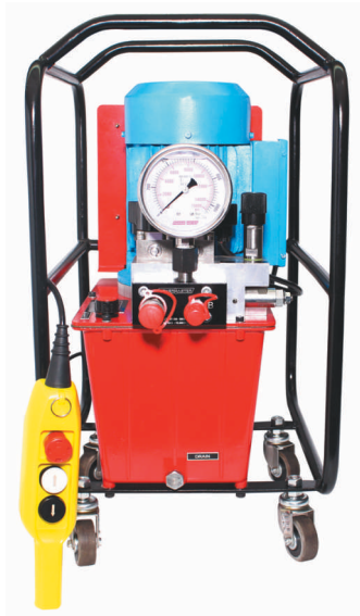
EP1000 with Mono Port