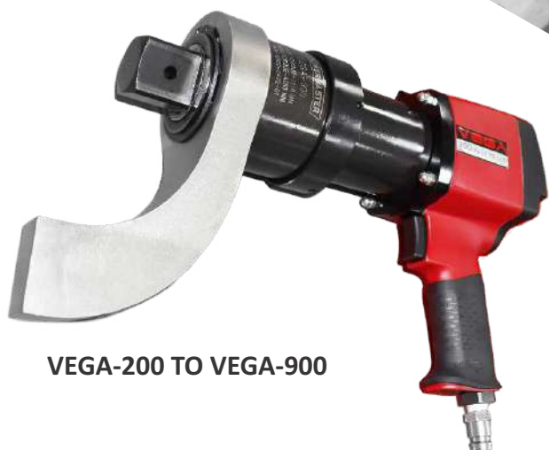
VEGA-200 TO VEGA-900