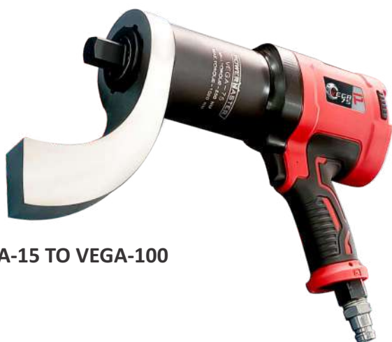
VEGA-15 TO VEGA-100