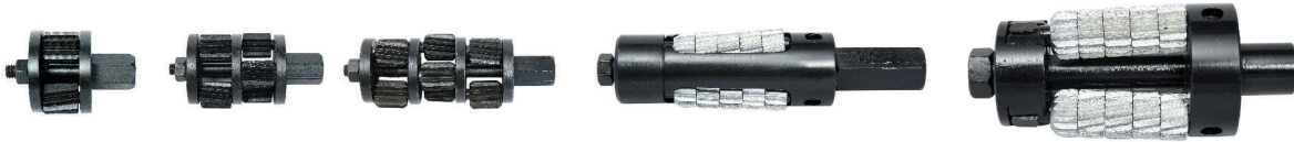
SINGLE LAYER 'H' TOOL