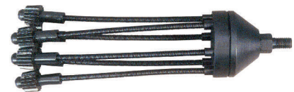
WING TOOLS-FLEXIBLE ARM CUTTER