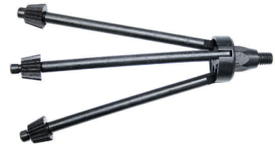
WING TOOLS-STIFF ARM CUTTER