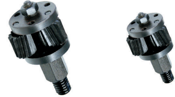
CYLINDER CUTTER TOOL